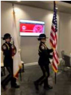
Thank you to the Roseville PD Honor Guard. Members take the Pledge of Allegiance.