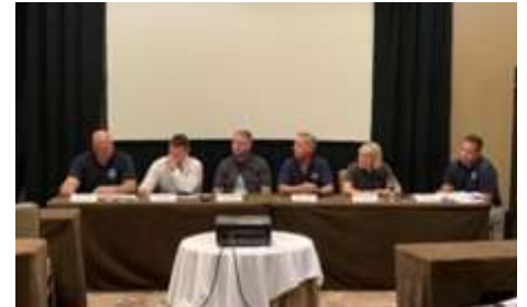
The Board working behind the scenes