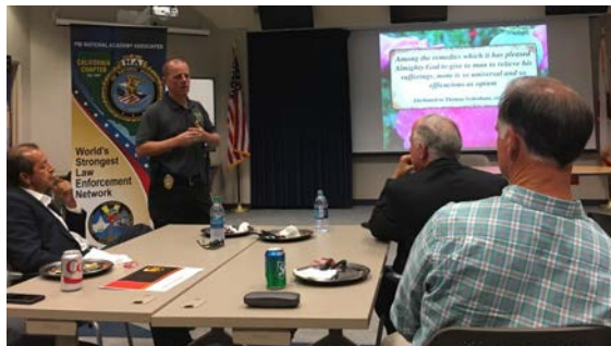
3rd Quarter Luncheon

Our 2017 holiday luncheon is sure to be a "hit" as we visit Dodger Stadium for an afternoon of networking with fellow NAA members as well as a private stadium tour. Hopefully, we'll be able to pose for a few pictures with the 2017 World Series trophy.