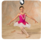
mother of pearl necklace