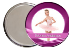
magnet or button