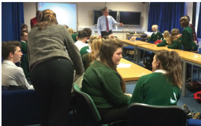
A UiS session with the school council representatives at Holyhead High School, February 2015