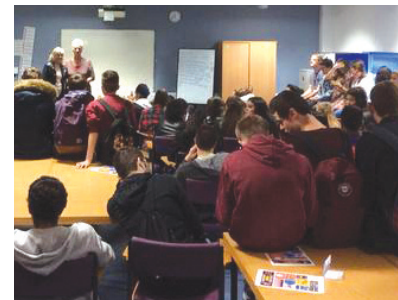
Unite in Schools, National Citizen Service, Derby College.