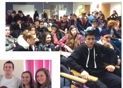
Longslade Community College, Leics.