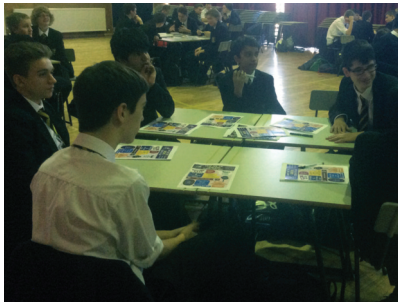
Boston Grammar School Students, enthused and engaged at Unite in Schools Day - 04 February 2015