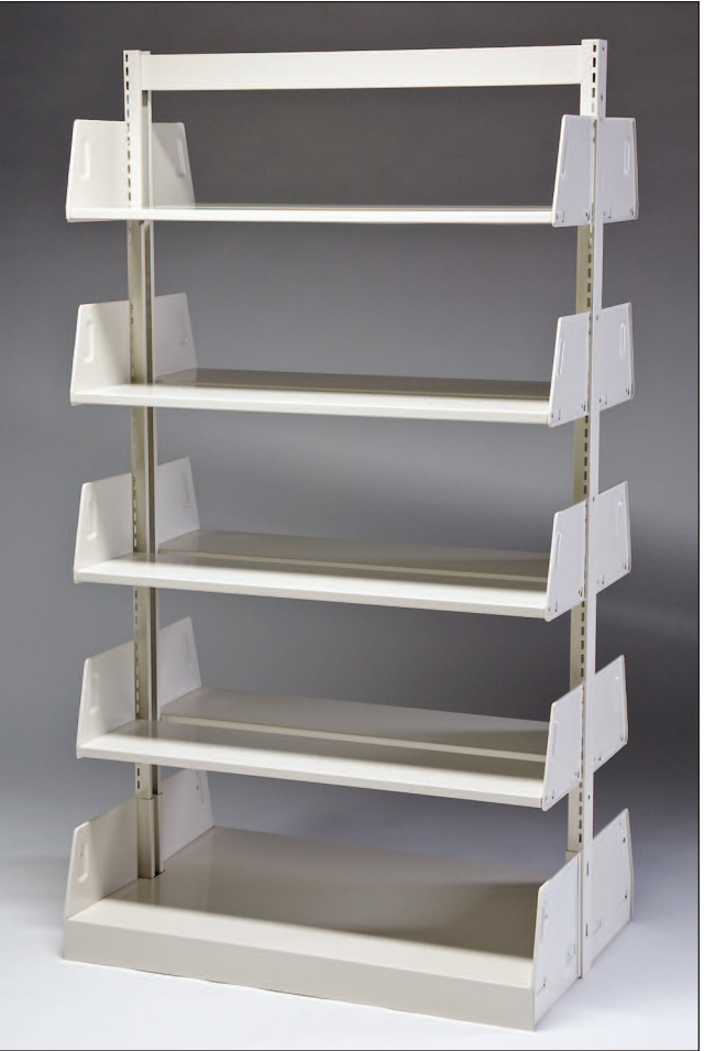
66" high unit shown above.

*NOTE: Units with an asterisk after the catalog number must be anchored to the floor or with a top tie strut. Units come standard 36" wide. 30" and 24" wide units are also available at the same price. When ordering 30" wide change catalog number to begin with MJ30 instead of MJ36. Special widths and heights are also available.