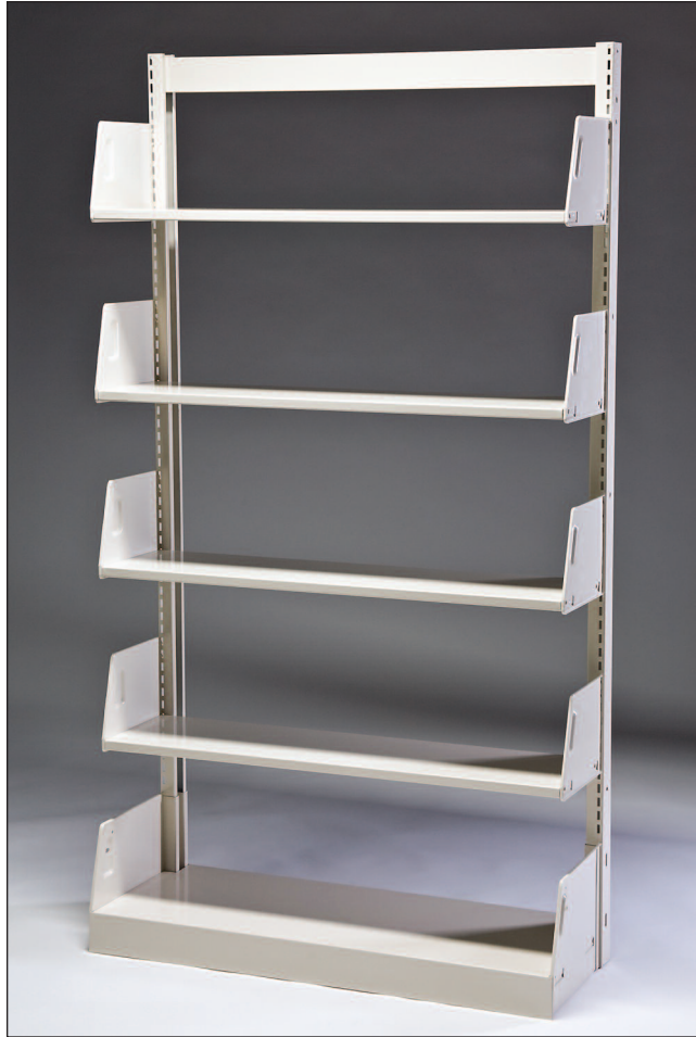
66" high unit shown above.

NOTE: All single faced units must be anchored to the wall. Units come standard 36" wide. 30" and 24" wide units are also available at the same price. When ordering 30" wide change catalog number to begin with MJ30 instead of MJ36. Special widths and heights are also available.