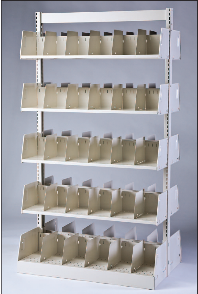
66" high unit shown above.

NOTE: All double faced units 78" and over must be anchored to the floor or with a top tie strut.