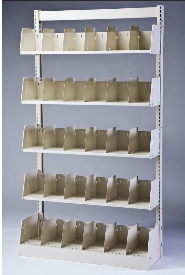
66" high unit shown above.

NOTE: All single faced units must be anchored to the wall. Shelves are slotted on 1" centers for dividers and have a 5" high back. Shelves come standard with five dividers per shelf.