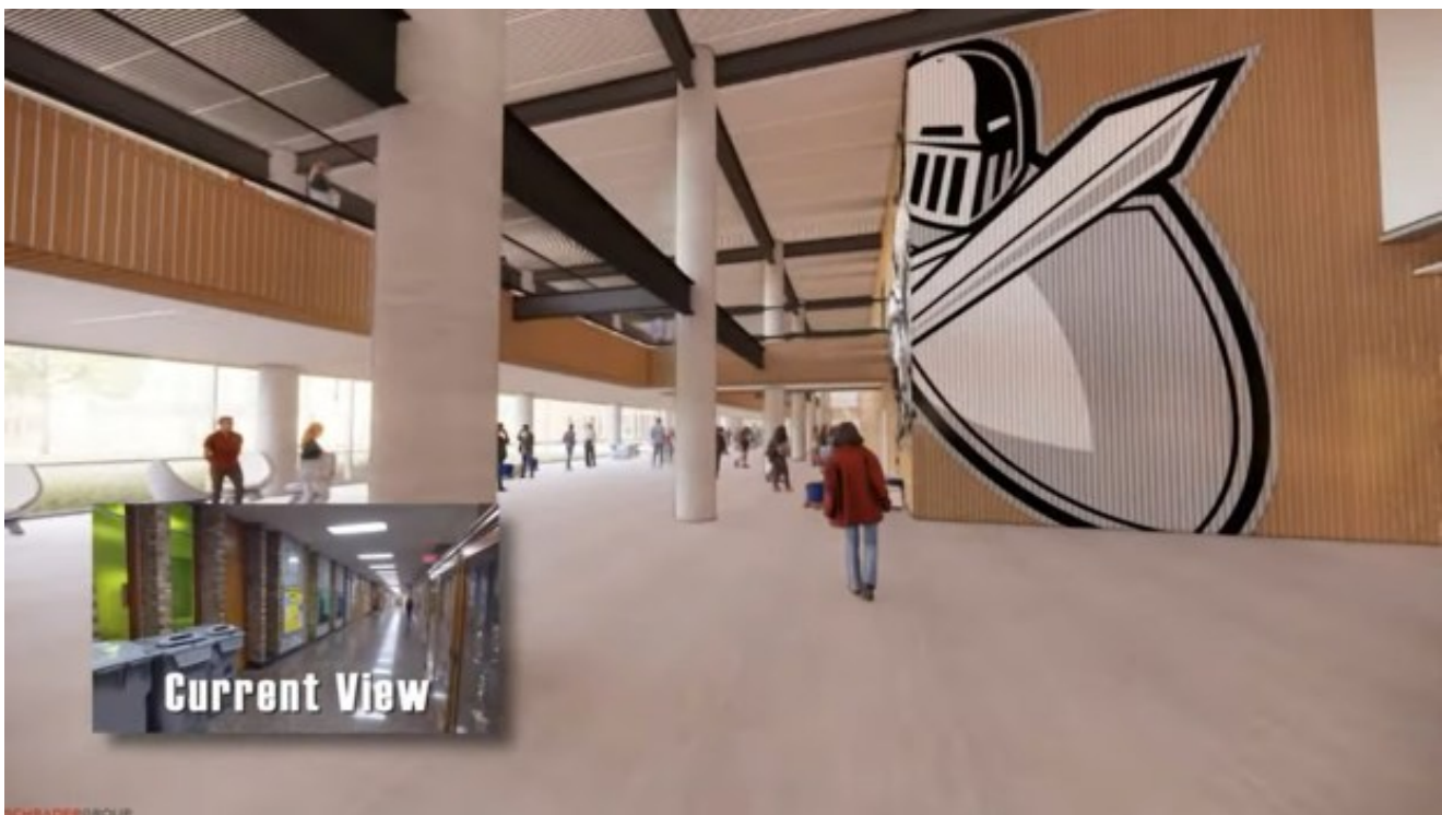
Expanded hallways and concourses within North Penn High School, with the current view shown alongside, as shown during a community forum on planned renovations on Tuesday, Dec. 5 2023.

District officials and consultants have estimated a $403 million price tag for a renovation that would add classroom space for 1,000 ninth graders to move to the high school complex if the referendum passes, and if the referendum fails, district officials have proposed a $236 million renovation meant to update the utilities through the school, but with minimal expansion. One question appeared on the ballot Tuesday: "Shall debt in the sum of $97,318,376 dollars for the purpose of financing new construction that includes space for ninth grade students to be educated on campus and renovations of North Penn High School be authorized to be incurred as debt approved by the electors?"