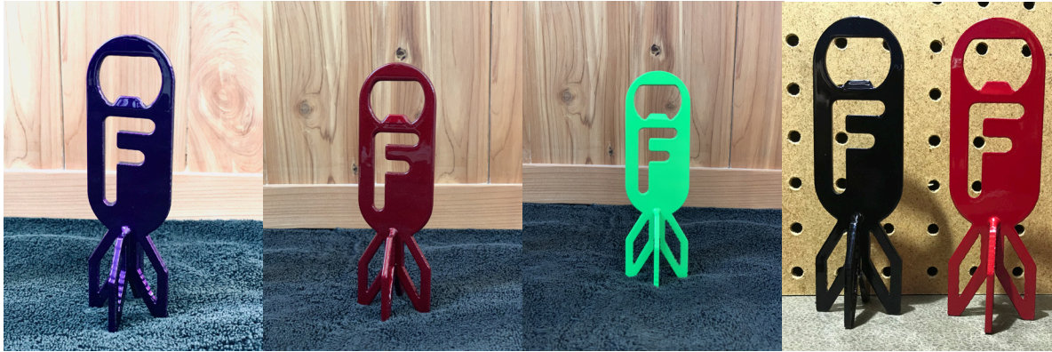
“F Bomb” Bottle Openers Unique 3D Design