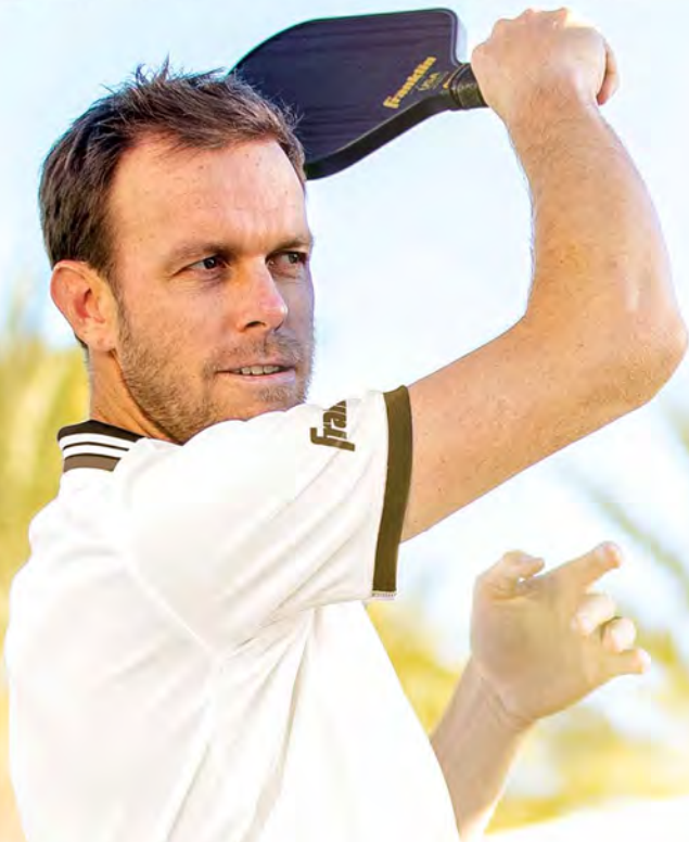
SAM QUERREY | PRO PICKLEBALL ATHLETE

T 877-377-6787 T 781-344-1111 F 781-344-0333 E B2B@FRANKLINSPORTS.COM