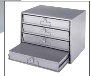
CA965 Cabinet and boxes sold separately