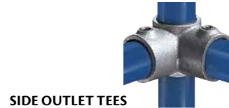
SIDE OUTLET TEES