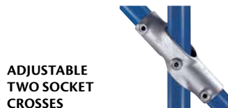
ADJUSTABLE TWO SOCKET CROSSES