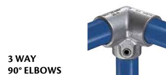
3 WAY 90° ELBOWS