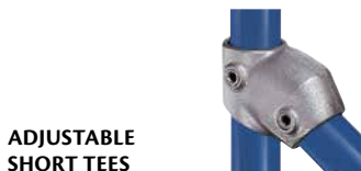
ADJUSTABLE SHORT TEES