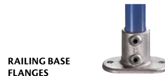
RAILING BASE FLANGES