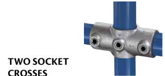
TWO SOCKET CROSSES