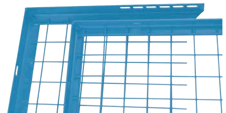
Adjustable Filler Panels

Adjustable filler panels fill in blank spots on the ends of wire mesh partitions to plug up potential security risks. Filler panels come in two sizes: 1' x 4' and 1' x 8' that slide over the ends of existing wire mesh sections. Bolt holes on the filler panels are separated per every inch and allow the filler panel to fill in a space between 6" and 10" wide. The holes line up with holes on the existing panel which are drilled in at the top and bottom to securely fasten the filler panel in two places.