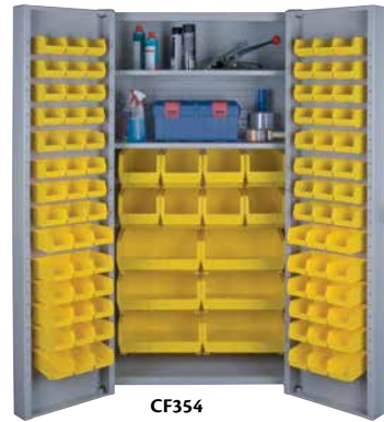
CF354 98 Bins