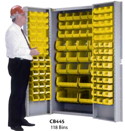
CB445 118 Bins