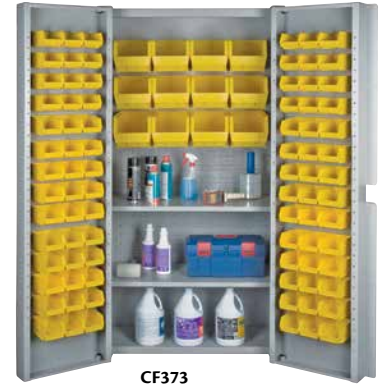
CF373 96 Bins