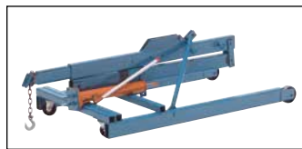
Folded for Storage