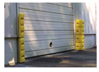
Sold per Set