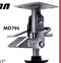
Plate size: 4" x 4 1/2" Holes slotted for: 2 5/8" to 3" x 3" to 3 5/8" Bolt hole size: 3/8"