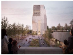
Obama Presidential Center