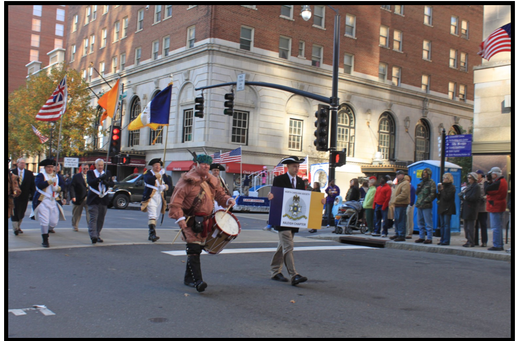
The Raleigh Chapter Color Guard and the "Blue Blazer Brigade" lead the Veteran's Day Parade in downtown Raleigh.