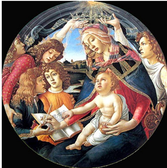
The "Madonna of the Magnificat" painted by Botticelli Filipepi in 1483 portrays Mary being crowned by two angels, while she writes the Magnificat and holds her Son, Jesus.

Collections April 30 & May 1, 2022 $3437