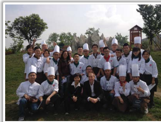
Princess Cruises will help to develop yourself and build your career

Princess offers amazing career opportunities for the right people. You have been selected to take up an opportunity with Princess for many reasons. We recognize that you have great skills for your position, a positive, happy and outgoing personality and of course a sense of adventure. Working for Princess gives you an opportunity to see some of the world. Often these are places that you had never thought of visiting.