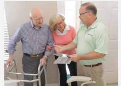
Lifetime Parts warranty