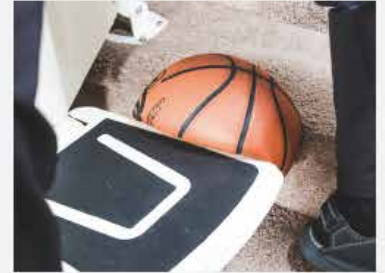
Safety obstruction sensors.