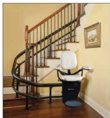
Curved Stair Lifts