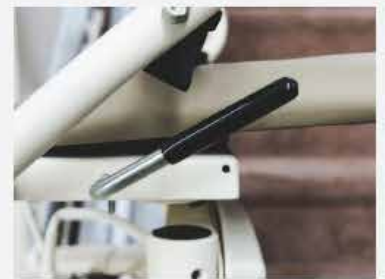
Swivel seat for a safe exit