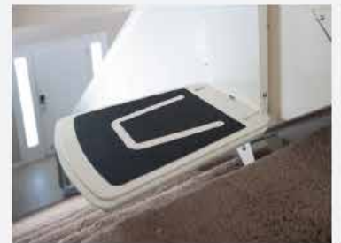
Wide footrests for stability and extra comfort.