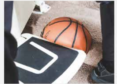
Safety obstruction sensors.