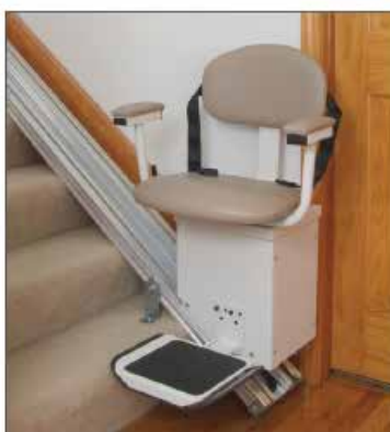
SL350 / SL350OutDoor