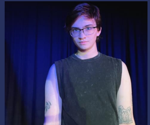
Graduating in April 2024 with a BA in Theatre, BS in Education

The Magnificent Baron Munchausen - Futluez, Vodomon, Moon Head #1, The Big Fish; Pippin - Follow Spot Operator; The Harvest - 2 nd ASM; She Kills Monsters - Sound board operator; Electra - 1 st ASM; Broadway Cares 2023 - Stage Manager; BGHS The Little Mermaid - Fly Crew; Evil Dead the Musical - Sound mixing; The Lover - Sound designer & 1 st ASM; POTUS - Light board operator; John Proctor is the Villain - Stage Manager; BG Opera Theatre: Cendrillon - Technical director; Scene Shop Employee, Vice President of Student Technicians, Artisans, & Designers (STAD), on the Quadball team