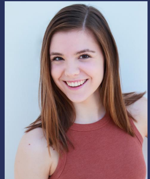
Graduating in April 2024 with a BAC specializing in acting and directing

I have had the honor to perform in shows such as The Train (Person B), Exit, Pursued by a Bear (Nan Carter), Hecate Hill (Kylie), The Harvest (Ada), Electra (Chrysothemis), and this semester I will be playing Raelynn Nix in John Proctor is the Villain . I have also been on both wardrobe crew and deck crew for a few productions as well as participated in staged readings including Lemonade Stand , My Body No Choice , and Medea Kills Her Children . Finally, I have been so grateful to be a part of the film side of our department by acting in student films such as Proxemics (Becca), The One Within the Woods (Mother), and Mother and Daughter (Cindy).