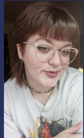
Graduating in April 2024 with a BA in Theater

I have had lovely opportunities to perform in shows like "The Most Massive Woman Wins" (Carly), "The Theory of Relativity" (Sara), "Electra" (Chorus), and this semester I have the spectacular chance to portray Heather Duke in "Heathers: The Musical". This past fall semester I had the delightful experience of Co-Directing "The Lover" by Harold Pinter within the Elsewhere Season. I have also acted in a student film, titled "Quintessence", and worked in tech elements of some shows here, like Sound Board Operation for "POTUS" and costumes for "Pippin".