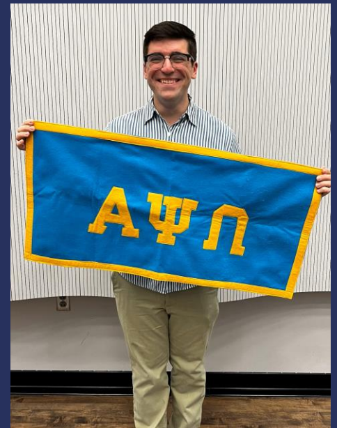
Graduating in May 2024 with a BA in Theatre and a BS AYA in Math

What has been your most impactful theatrical experience here at BGSU?