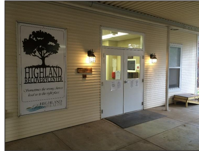
Highland Recovery Center Pickens County – Jasper