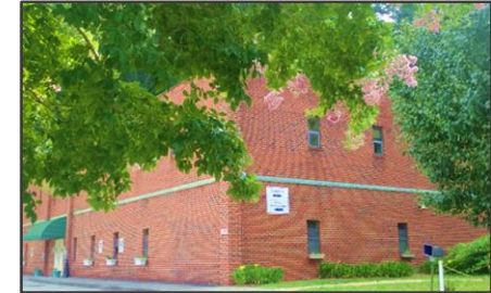
Whitfield County – Dalton