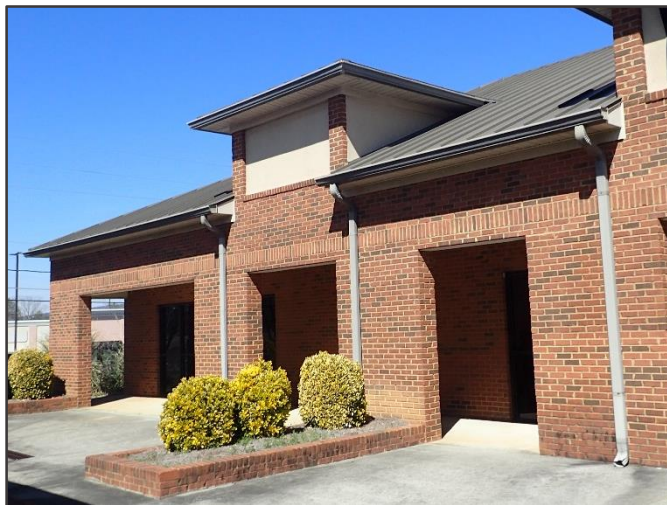
Choices Clubhouse Substance use Floyd County – Rome