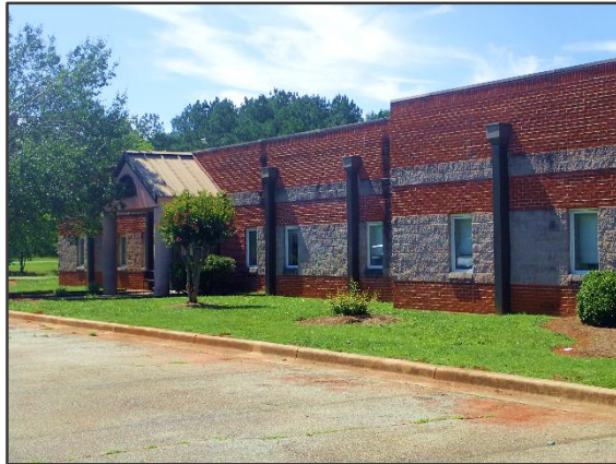
Residential Treatment Unit Polk County – Cedartown