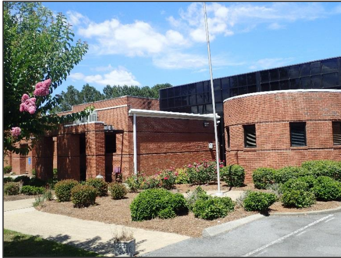
Women's Outreach Floyd County – Rome