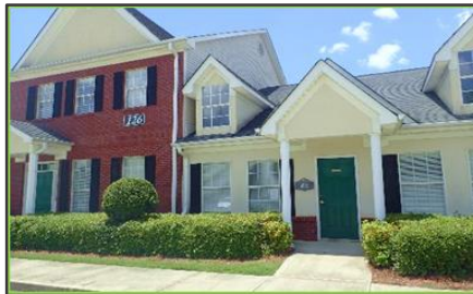
Paulding County – Hiram