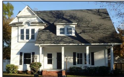
Gordon County – Calhoun