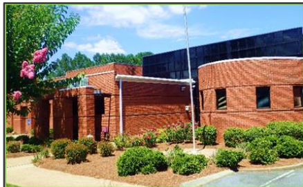
Floyd County – Rome