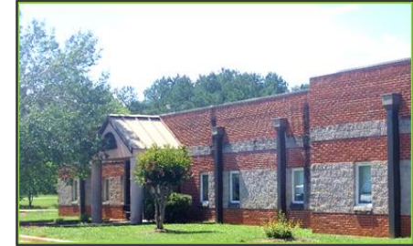
Polk County – Cedartown