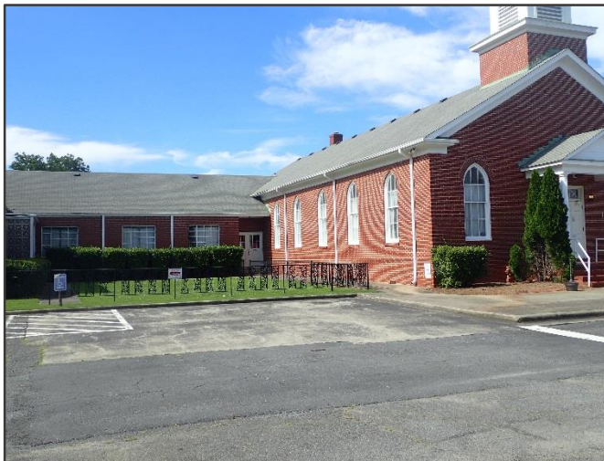
ROC Clubhouse Mental health/resiliency Bartow County – Cartersville