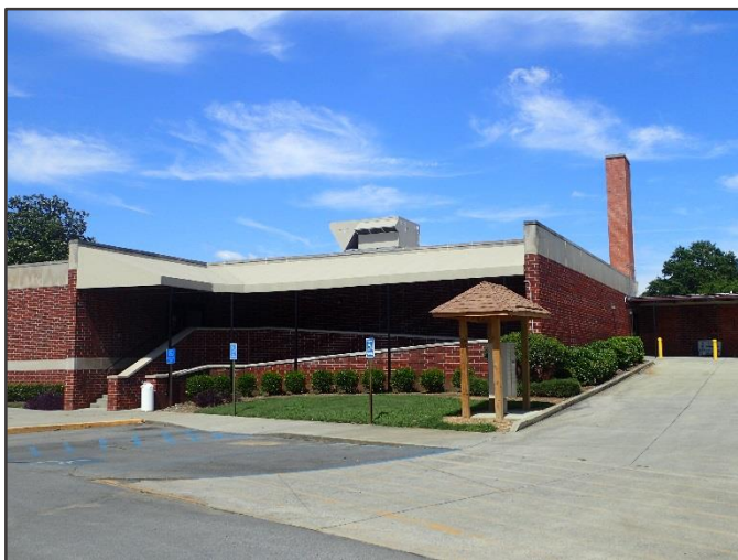
One Door Polk Polk County – Cedartown

Many programs that serve individuals with intellectual and developmental disabilities operate under the Kaleidoscope program