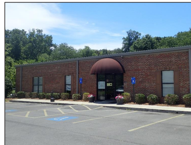
Cleveland Highway Whitfield County – Dalton