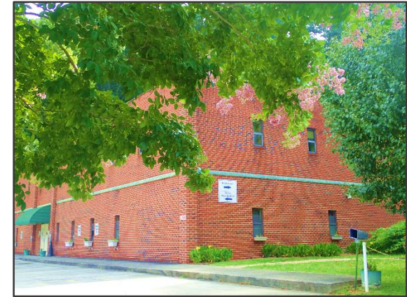
Treatment Services Whitfield County – Dalton