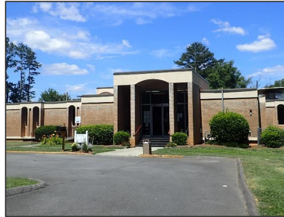
Crisis Stabilization Unit Floyd County – Rome