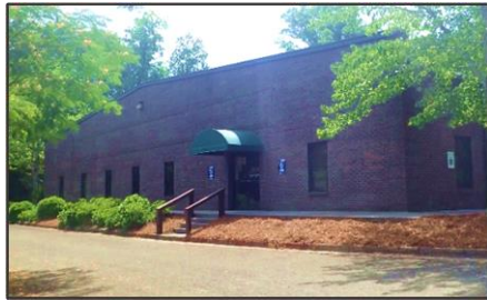
Cherokee County – Canton