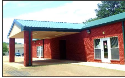
Gilmer County – Ellijay