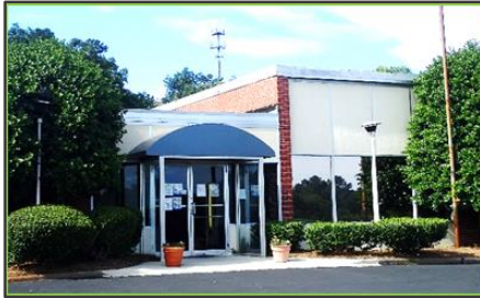
Bartow County – Cartersville