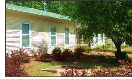
Pickens County – Jasper