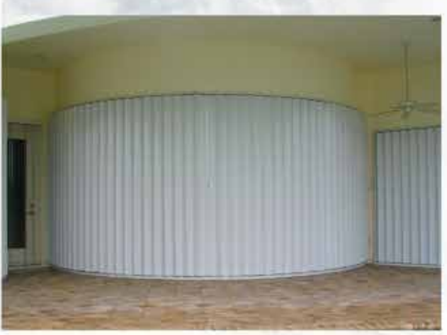
Curved or radius tracks available for balconies & bay windows

Moderately priced, the accordion shutters give you "peace-of-mind", knowing that you can quickly and easily lock/secure them from the inside or outside. They can also be used many times throughout the year, regardless of storms, as a form of privacy, sun control, security, or as a wind break.