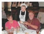
Harvey Girls Luncheon

Leavenworth was once home to Fred Harvey, the visionary who launched a chain of restaurants in train depots across the country during the late 1800s. These establishments became famous for their uniformed hostesses, known as "Harvey Girls", who provided food and refreshments to hungry train passengers. This afternoon, we will enjoy a delicious barbecue brisket lunch at the historic downtown train depot, served by women dressed in traditional Harvey Girl attire. Adding to the fun, musical entertainment will be provided by performers in classic black and white jail stripes.