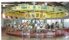
C.W. Parker 1913 Carousel Ride

This morning, we travel to Leavenworth, Kansas, to visit the C.W. Parker Carousel Museum, a treasure trove dedicated to preserving the charm of antique carousels. Tour the restoration rooms and discover the intricate process behind bringing these beautiful works of art back to life. Then, enjoy a ride on a fully restored 1913 wooden carousel – complete with easy-to-access bench seats for those who may find it difficult to climb onto a traditional horse.