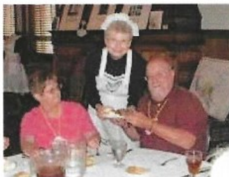
Harvey Girls Luncheon

Leavenworth was once home to Fred Harvey, the visionary who launched a chain of restaurants in train depots across the country during the late 1800s. These establishments became famous for their uniformed hostesses, known as "Harvey Girls", who provided food and refreshments to hungry train passengers. This afternoon, we will enjoy a delicious barbecue brisket lunch at the historic downtown train depot, served by women dressed in traditional Harvey Girl attire. Adding to the fun, musical entertainment will be provided by performers in classic black and white jail stripes.