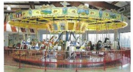
C.W. Parker 1913 Carousel Ride

This morning, we travel to Leavenworth, Kansas, to visit the C.W. Parker Carousel Museum, a treasure trove dedicated to preserving the charm of antique carousels. Tour the restoration rooms and discover the intricate process behind bringing these beautiful works of art back to life. Then, enjoy a ride on a fully restored 1913 wooden carousel -- complete with easy-to-access bench seats for those who may find it difficult to climb onto a traditional horse.