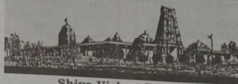
Shiva-Vishnu Temple Om Namah Shivaya Om Namo Narayanaya