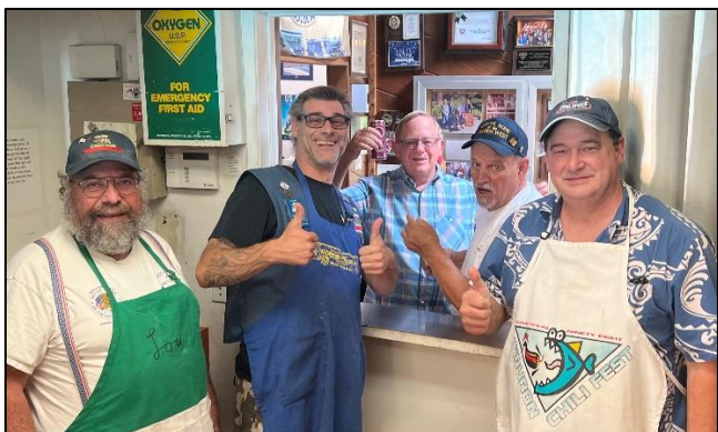
The Dream Team

The weather was perfect, the food was delicious, and the pool was packed.