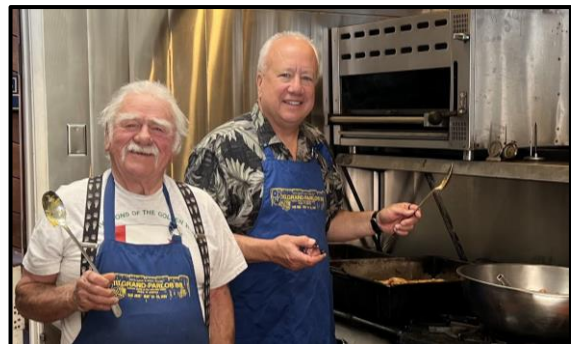
'The Silver Spoons'

Crispy Mediterranean chicken, sauteed potatoes and onions – an amazing lunch that really tickled our ivories.