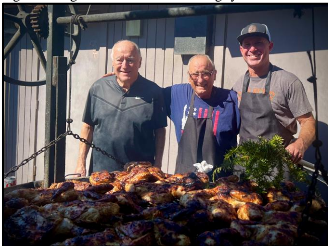
Heat, Smoke and Fire or A Bad Day for Chickens