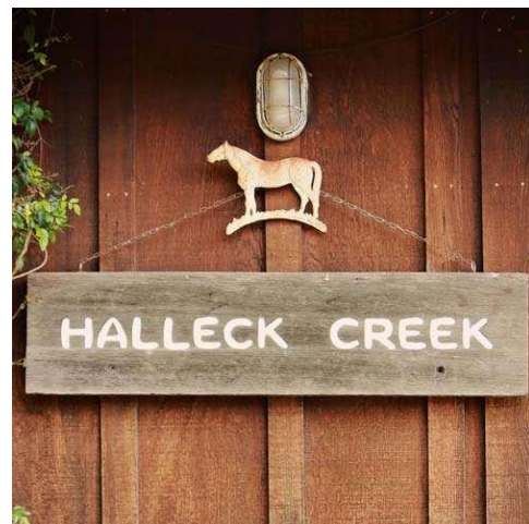
Click this link to learn more ...

has contributed a case of wine to be used for our Xmas party raffle with half the proceeds to go to the NSGW and the other half to go to Halleck Creek Ranch; a local non-profit serving children and adults with disabilities.