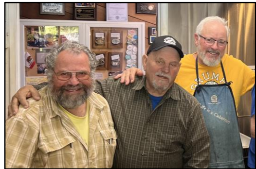
Los Tres Amigos