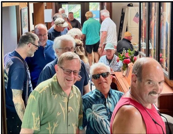
Everyone that likes to eat