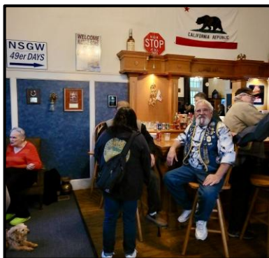
Five minutes later...

After setting up we were off to the parlor for the get-acquainted reception – a great place (with a great bar) to see old friends and meet some new ones. You could hear the glasses clinking and ice cubes tinkling amid the ebb and flow of many cheerful conversations as we all swirled around the room getting re-acquainted and sampling the many hors d'oeuvres.