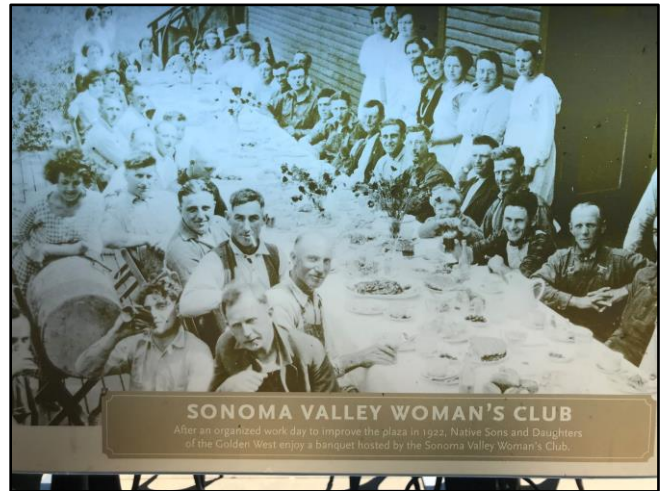
Caption: 'After a work day to improve the Sonoma Plaza in 1922, Native Sons and Daughters of the Golden West enjoy a banquet hosted by the Sonoma Valley Woman's Club.'