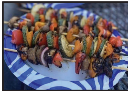
L-R: Tomato, Zucchini, Bell Pepper, Red Onion and Mushrooms