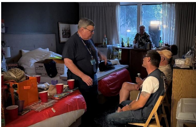
And then it went dark...

But we pulled it off. Except there were problems! I returned to the room on Wednesday night to find the power out for our room and adjacent rooms. We called for maintenance twice to reset the breaker, hoping the lights would come on before it got really dark as we didn't want to do a camping trip at the hotel. There were apparently too many appliances operating at the same time on the floor setting off the breaker.