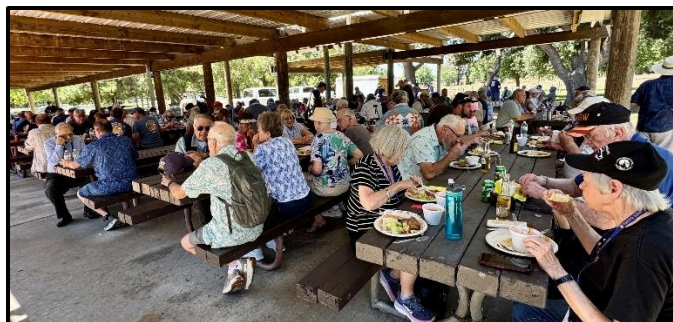
The Grand Barbeque

But we pulled it off. And we had an enjoyable time visiting with the delegates and guests while running an ongoing campaign, pouring drinks, serving food and snacks, and selling and pulling raffle tickets. This project, though, is not for the faint of heart.