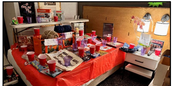
No place to sleep in a campaign room

The Parlors would contribute individual Raffle prizes, while Nicasio/Petaluma would also hold a playing card Raffle where each of the 52 cards sell for $20, the card then torn in half, and two winners would get $300/each by matching their winning card picks. We would keep the rest for expenses.