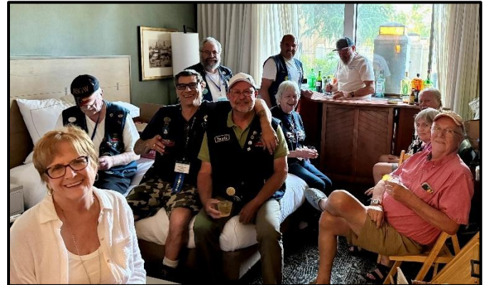
Our Campaign Room

an emphasis on busy)! Sharing a Campaign Room (not called "Hospitality Room" due to Hotel regulations) to help defray expenses added to both the complexity and enjoyment of this event. Nicasio/Petaluma Parlor#183 and my Parlor, Fairfax Parlor #307, decided to share a Campaign Room. I'm not aware of any of the Parlors doing this before.