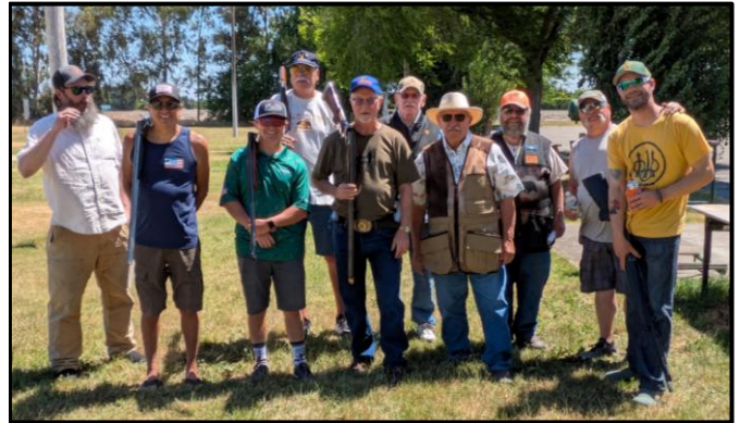
Good guys with guns

After shooting we were off to the BBQ for some great food and drink, A Great Day To be a Native Son. Native Son's functions are a wonderful way to meet new friends and see old acquaintances.