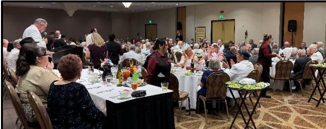
The Grand Banquet

I have attended seven Grand Parlors, but this is the first one I have attended both as a Grand Trustee and one where I am running for reelection. I had a busy and fun time (with