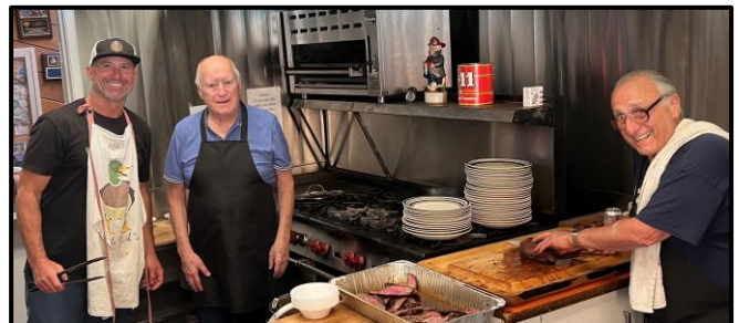
Fire and Smoke

And then they gave everybody in the clubhouse an even bigger treat when they served it – grilled to perfection – the way Joe does it every time! Thanks guys!