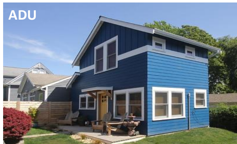
Des Moines Housing Action Plan - Community Open House - November 15 + December 3, 2022