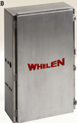
TYPE I Electronic Cabinet