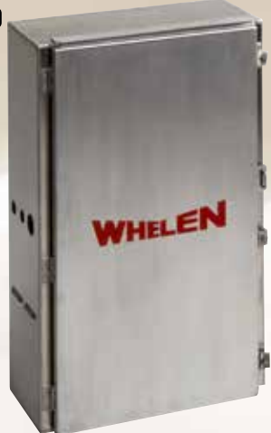
TYPE I Electronic Cabinet