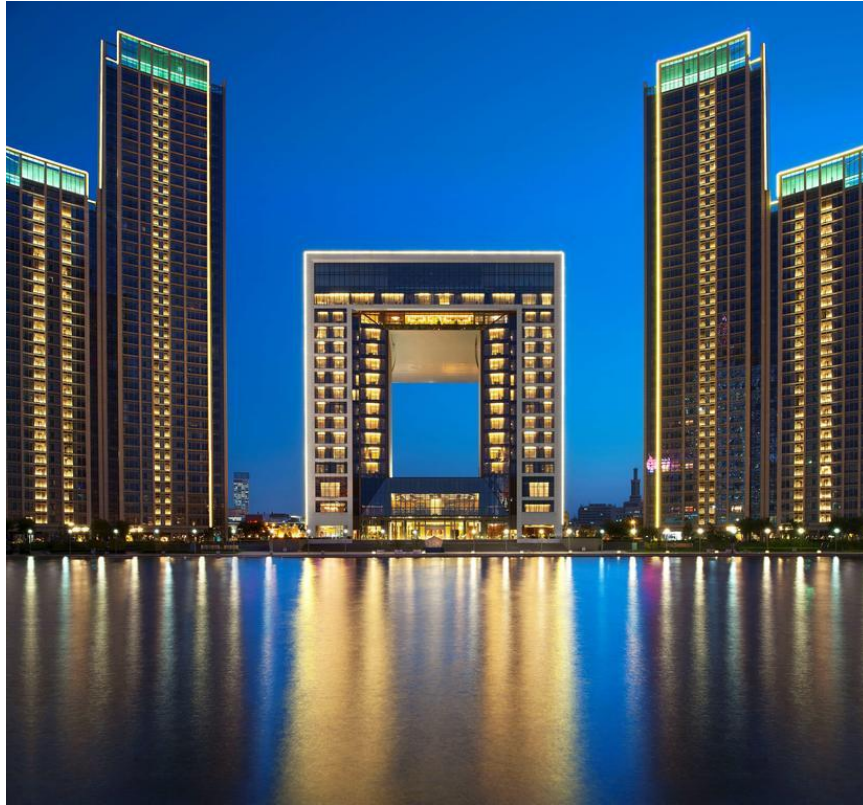
The St. Regis Tianjin

No.158, Zhangzizhong Road, Heping, 300041 Tianjin, China