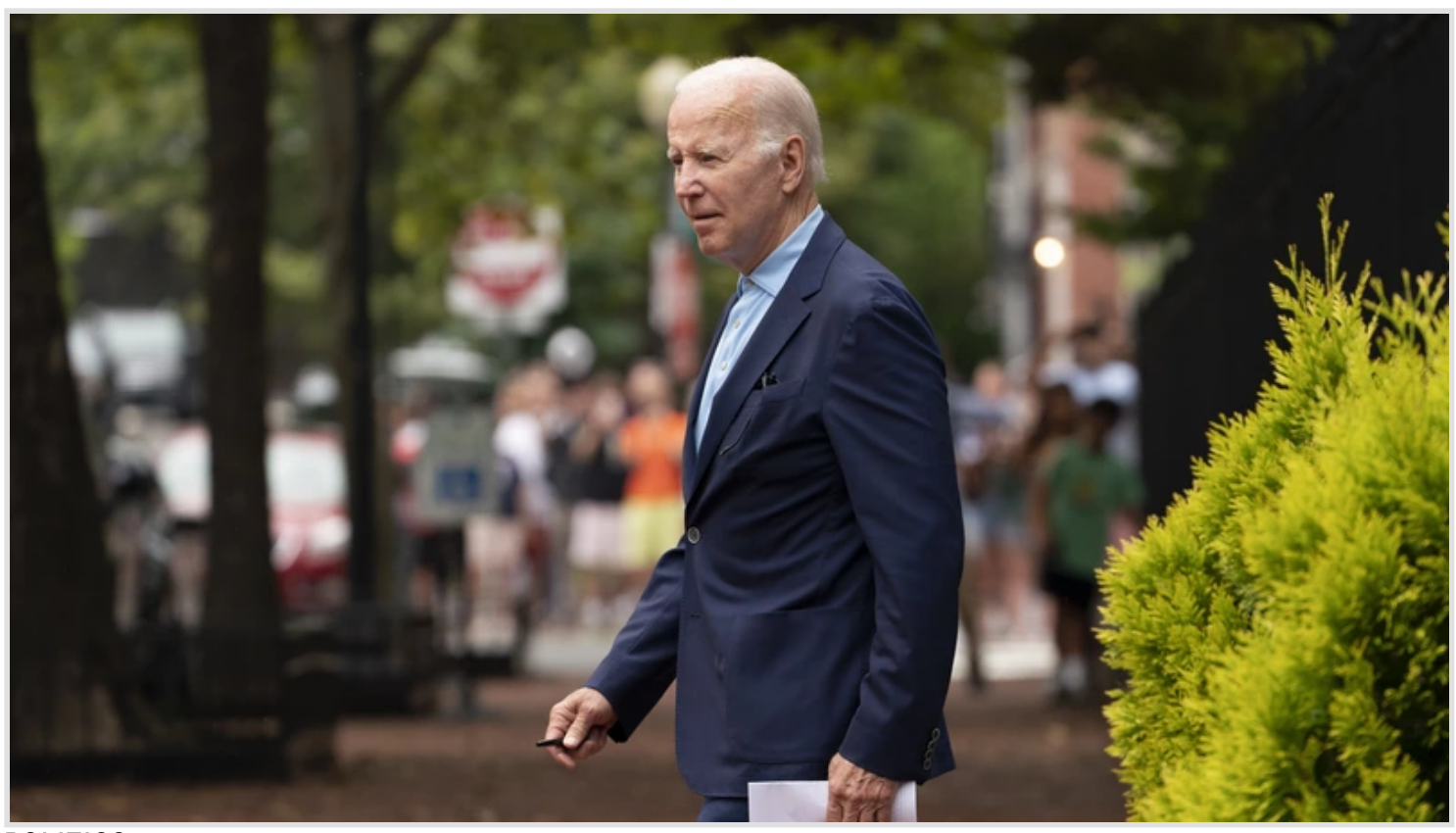
POLITICS Biden tests positive for COVID and shows mild symptoms, White House says