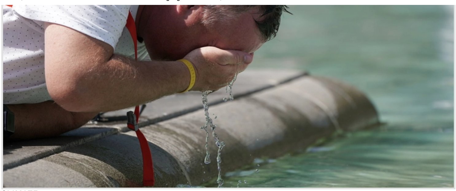
CLIMATE The U.K. breaks its record for highest temperature as the heat builds