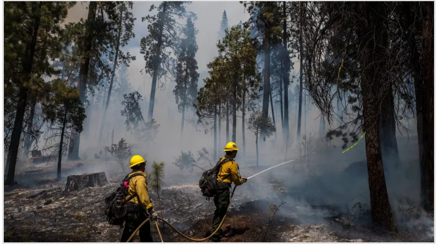
CLIMATE Decades of 'good fires' save Yosemite's iconic grove of ancient sequoia trees