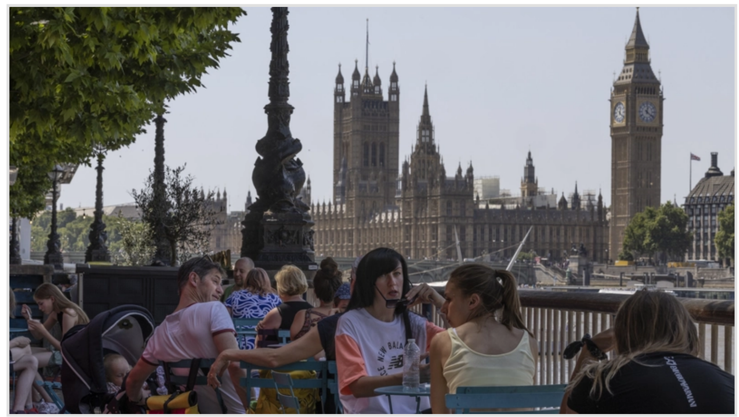
WEATHER Why 100-degree heat is so dangerous in the United Kingdom