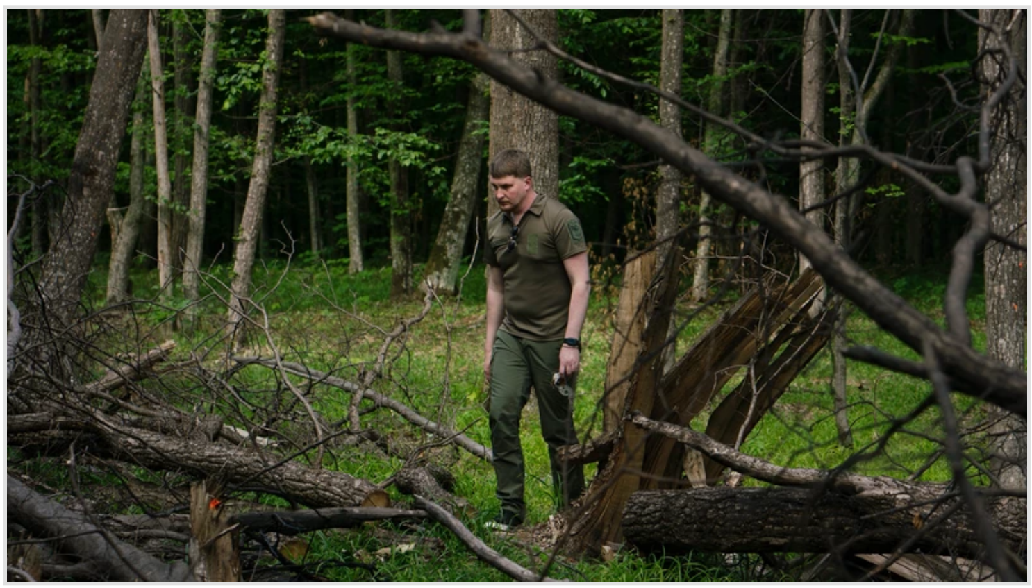
SCIENCE Russia's War In Ukraine Is Hurting Nature