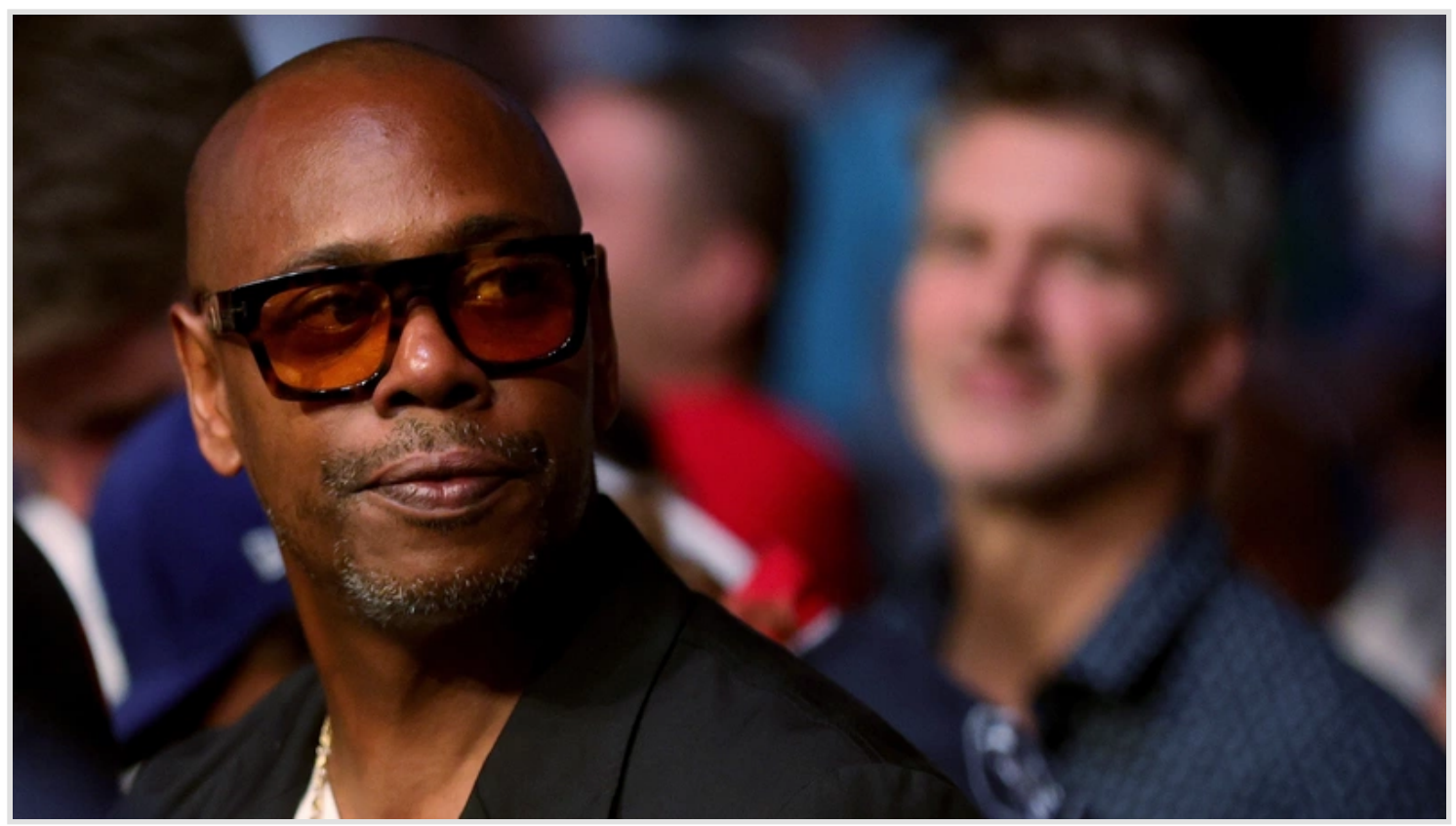
CULTURE A Minneapolis venue canceled a Dave Chappelle set hours before showtime