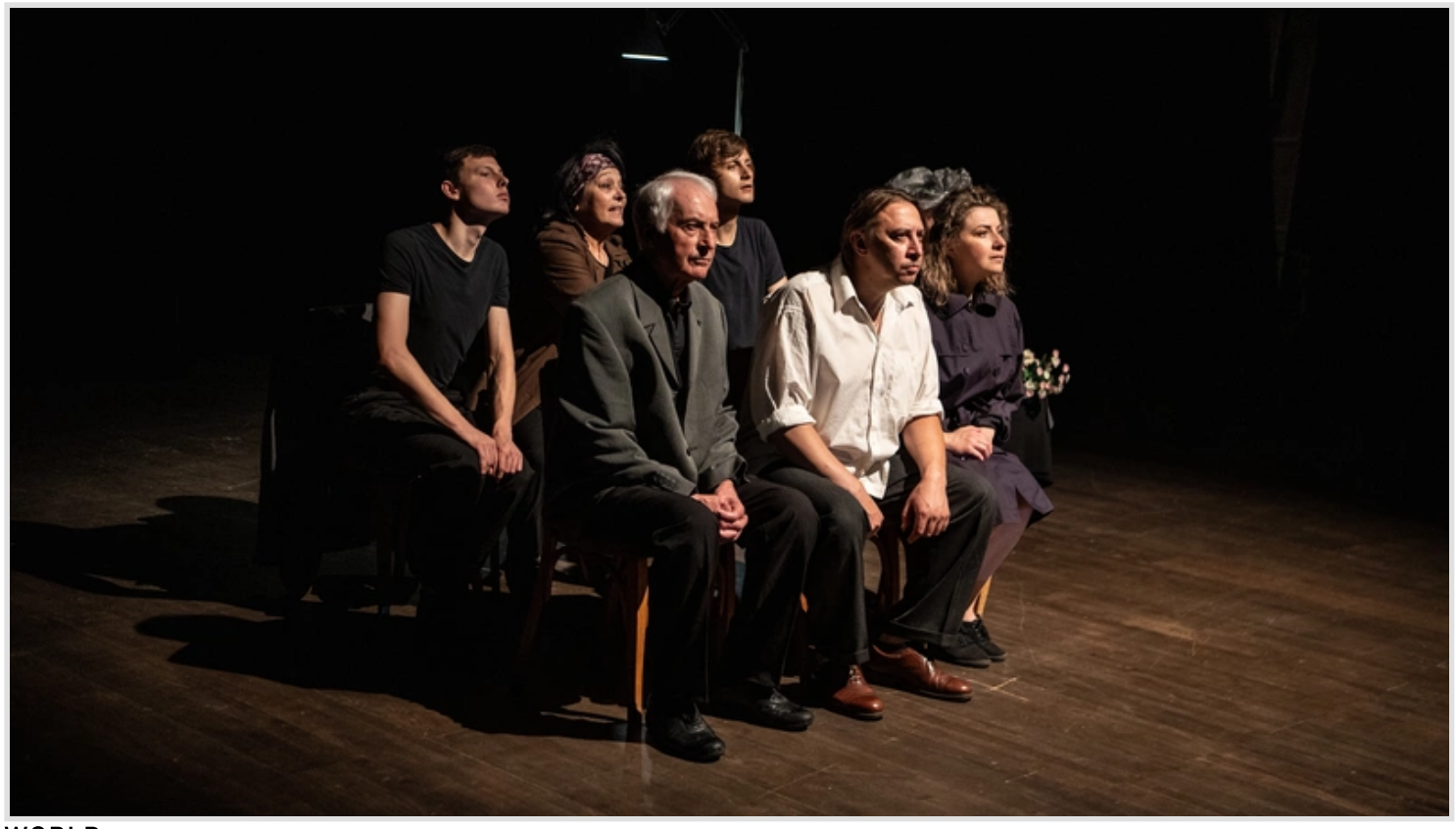
WORLD A Mariupol theater troupe is back on stage with a homegrown Ukrainian play