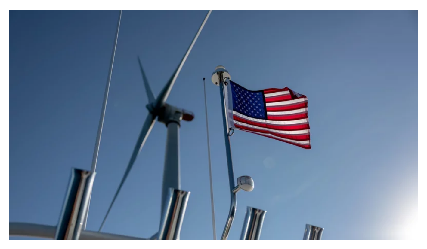
A wind turbine generates electricity at the Block Island Wind Farm on July 7, 2022 near Block Island, RI.

As President Biden's climate ambitions continue to languish in the Senate, he traveled to the site of a former coal power plant in Massachusetts to announce new funding designed to help communities bear extreme heat, as well as tout the country's developing offshore wind industry.