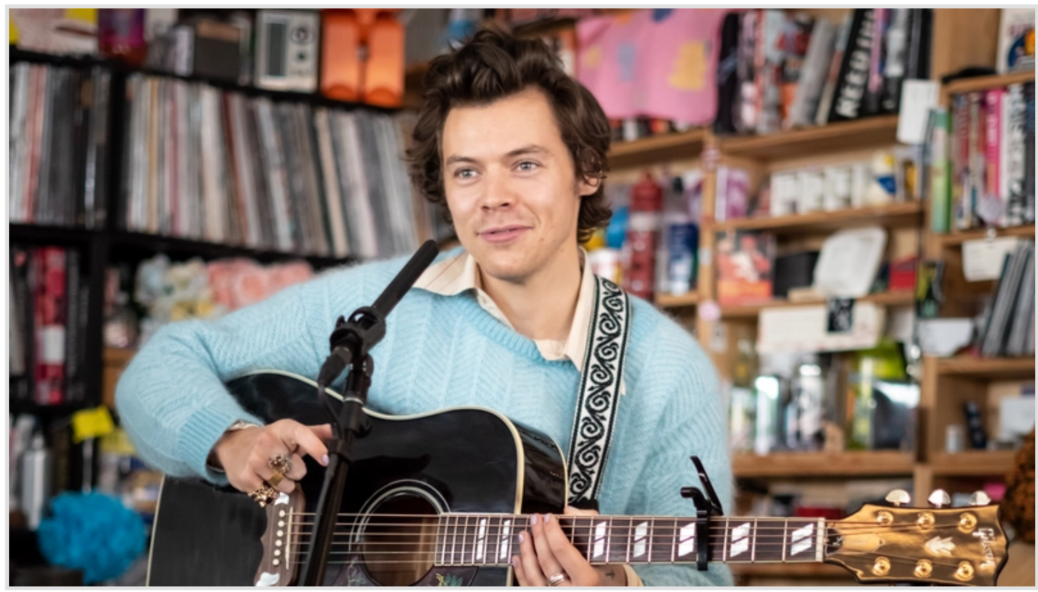
DOD CIII TIIRE