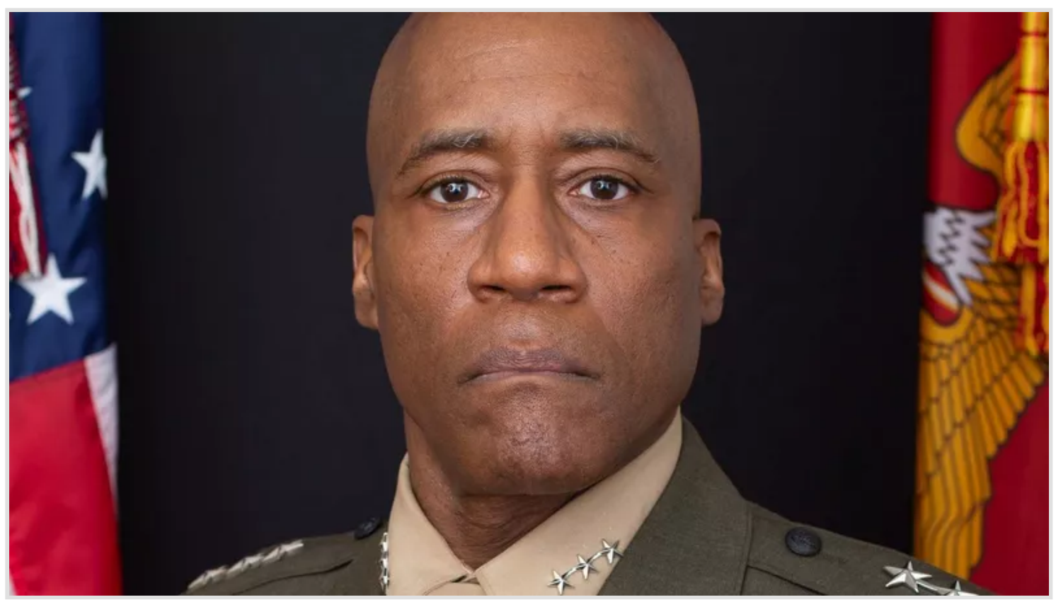
RACE The Marines are set to have the first Black 4-star general in their 246-year history