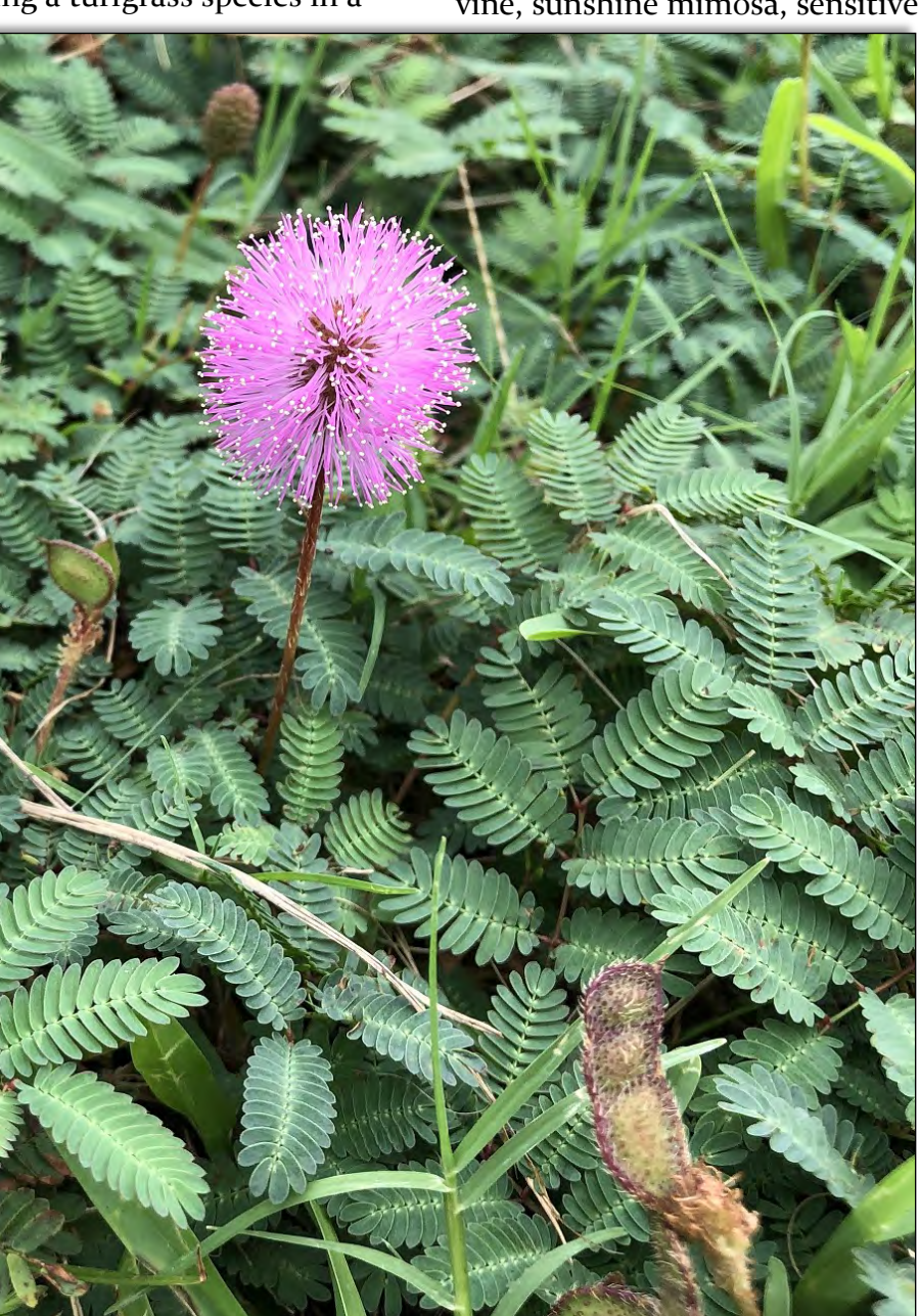
In this photo you can see the bipinnately compound leaves, flower and developing seed pods of a mimosa vine Mimosa strigillosa.

vine, sunshine mimosa, sensitive vine, and powder