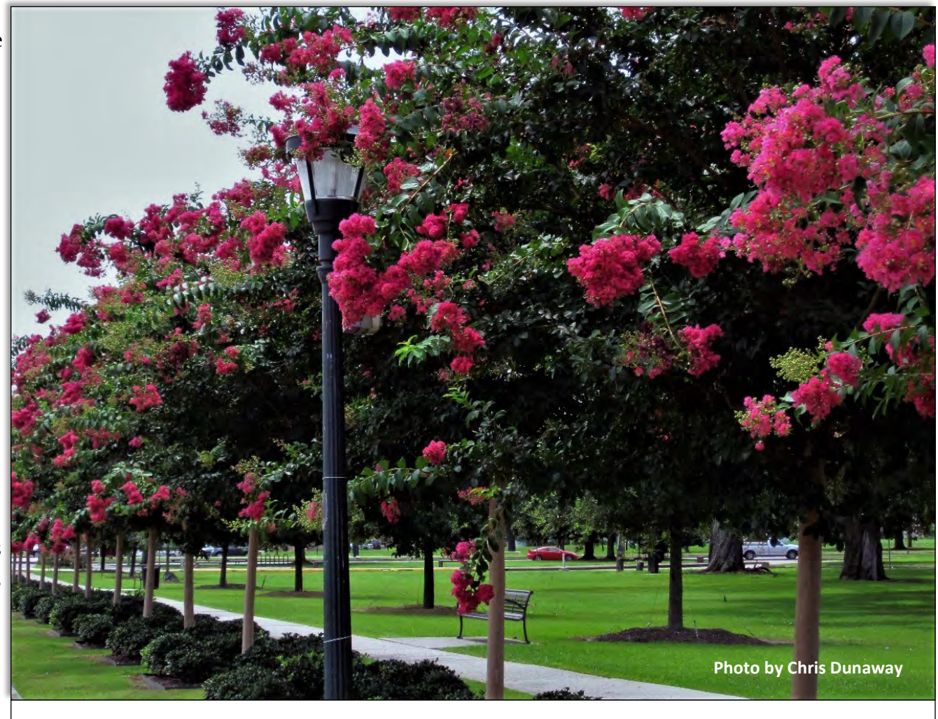
Crape myrtle trees lining the entrance to New Orleans City Park.

Crepe myrtles are deciduous multistemmed shrubs or small single stem trees with opposite,