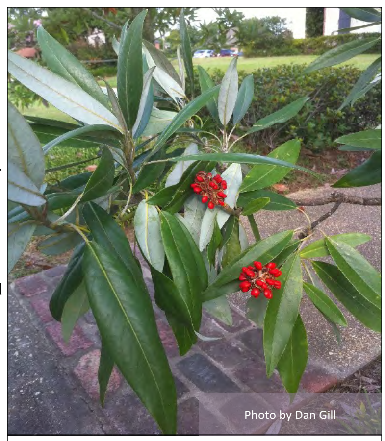
The sweetbay magnolia produces bright red seeds that mature in autumn on cone-like pods.