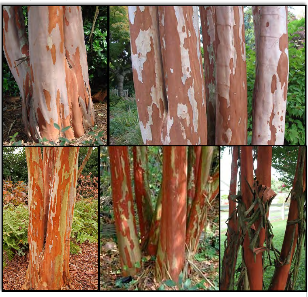
The dramatic effect of crepe myrtle bark exfoliation.

Williamson, Joey. 2021. Crape Myrtle Bark Scale. Clemson Cooperative Extension. HGIC 2015. <a href="https://bngic.clemson.edu/factsheet/crapemyrtle-bark-scale/">https://bngic.clemson.edu/factsheet/crapemyrtle-bark-scale/</a>