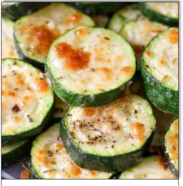
Finished baked zucchini.