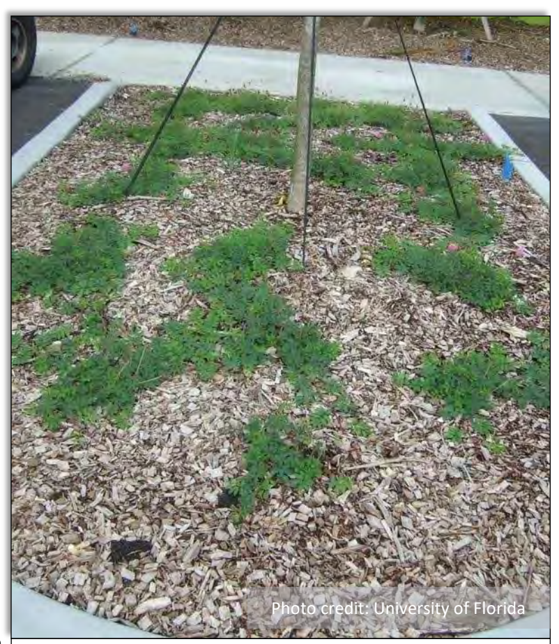
First day of planting mimosa groundcover. One gallon plants were used, with a 2 to 3 inch layer of coarse mulch covering the bare ground.