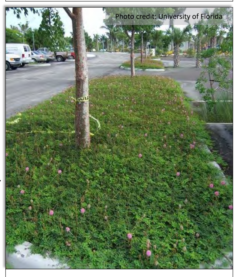
Mimosa groundcover 6 months later.