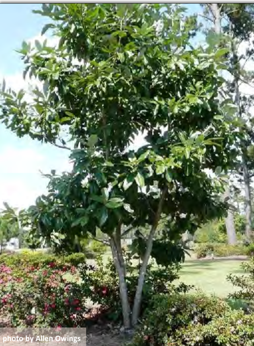
A young sweetbay magnolia tree with three trunks.

adapted to many soil conditions, including the packed (and often saturated) clay-based soils of the greater New Orleans area. Fall and winter are the ideal time to plant. Choose a healthy nursery tree and trim away any circling roots. It can thrive in full sun to