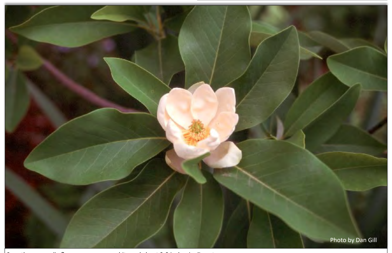
Sweetbay magnolia flowers are creamy white and about 2-3 inches in diameter.