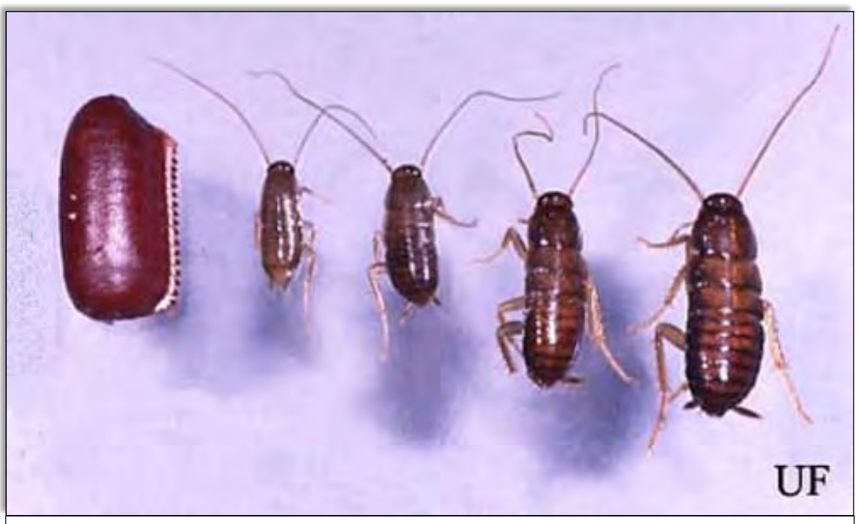
Ootheca and first, second, third and fourth instar nymphs of the American cockroach, Periplaneta americana (Linnaeus).

diatomaceous earth can be applied to voids and other harborages such as cracks and crevices. Do not apply dusts to wet or damp areas. Dusts should be applied lightly because heavy deposits may repel cockroaches. Do not place dusts where children or pets could come