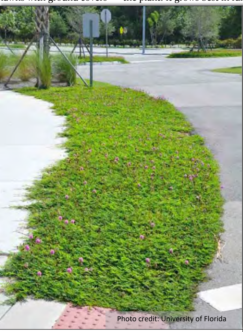
A curbside display of mimosa.

A soil analysis should be conducted prior to planting to determine if soil amendments of phosphorus and potassium are needed and that soil pH is 4.2 or greater. Avoid fertilization with nitrogen as it will promote weed competition, especially from warm season, annual grasses. Powderpuff, if inoculated, will fix its