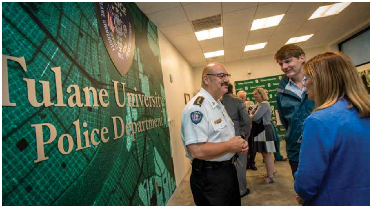
The Tulane Police Department also has headquarters located in the downtown medical district.