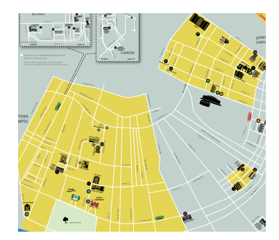
View the all-routes map at tulane.it/ShuttleLines.

Please note that lines and service may change from year to year.