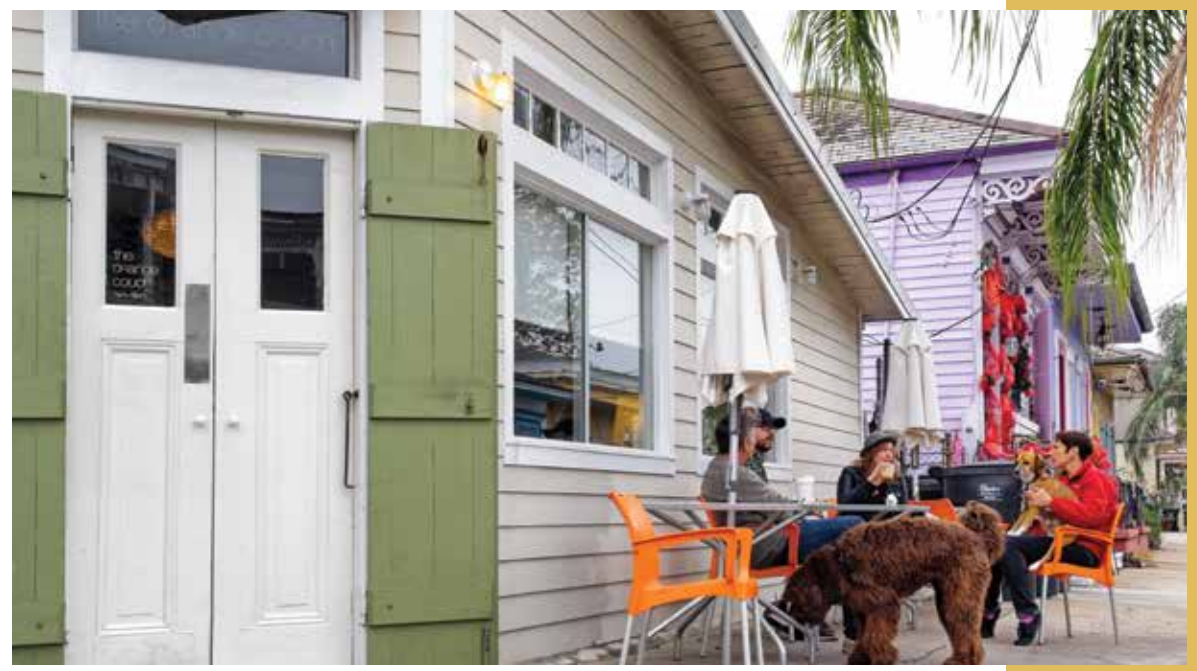
Understanding that you are now a part of a residential community is one of the most important aspects of living off campus.