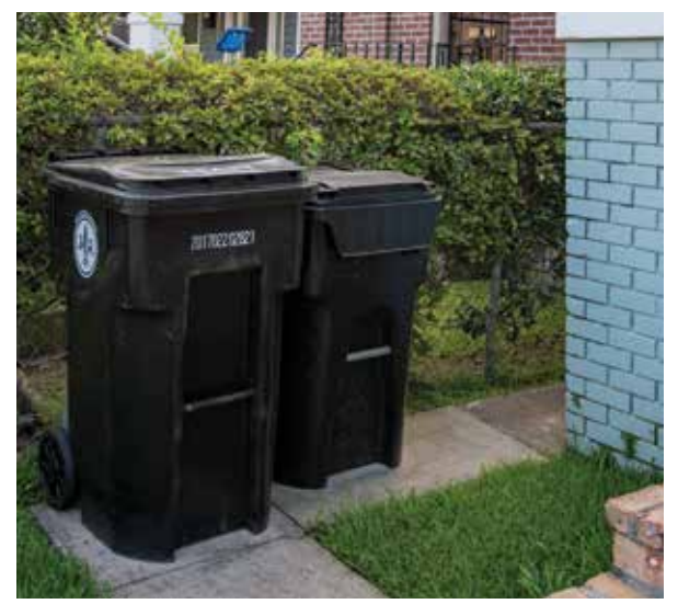
Cans should be put out for collection between 4 p.m. the day before and 6 a.m. on collection day (left). Other than collection days, trash and recycling cans should be stored on your property (right).