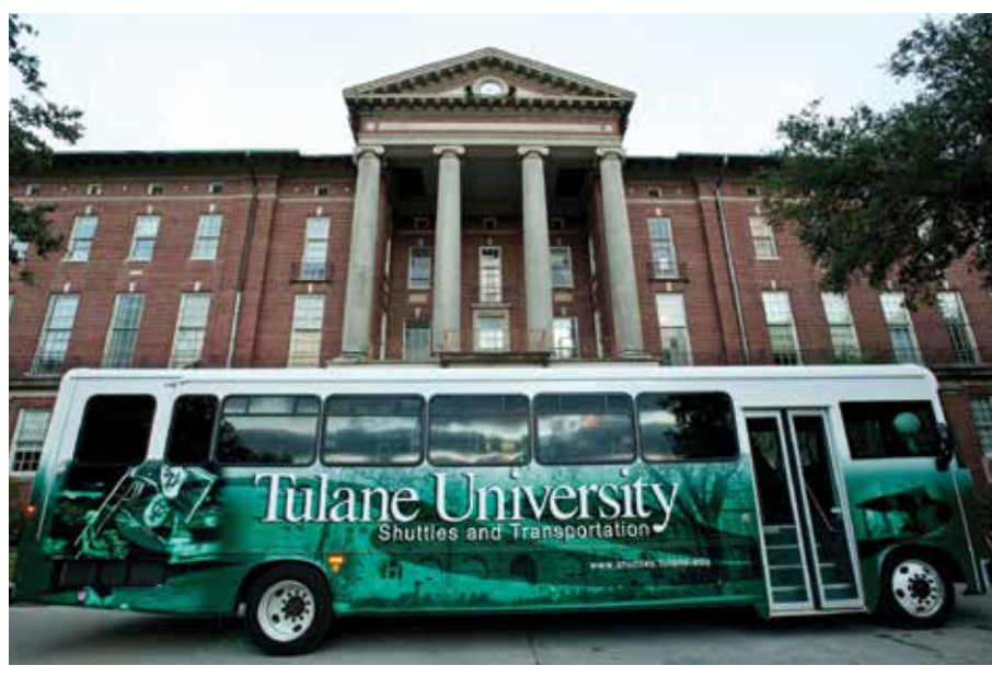
Tulane shuttle buses service both the uptown and downtown campuses.