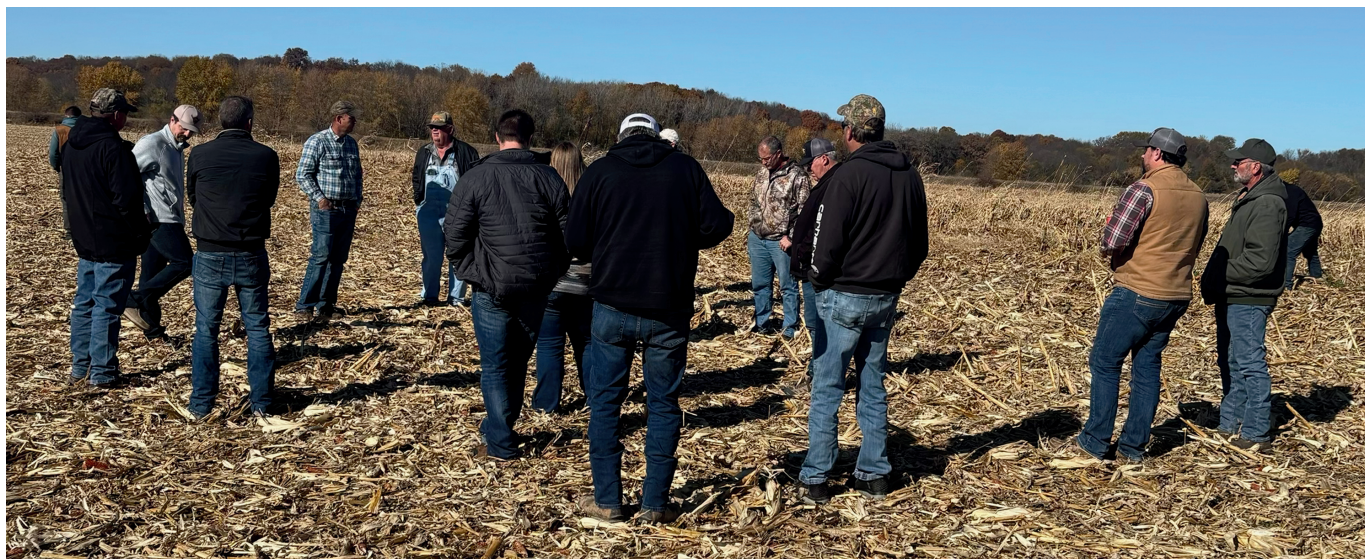
Grazing Field Day