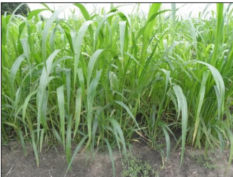
Above: Sudan grass 30 days following planting. Planted 6/23/13.

should be 18 inches tall before grazing; Drought stunted or frosted plants; high nitro-