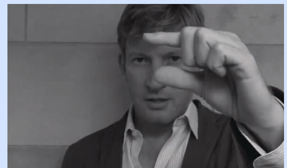
"This Much" water is enough for a child to drown in.

The Coalition is launching a PSA campaign with particular emphasis on Hispanic radio, many of the recent drownings and near drownings in our area have involved members from the Hispanic community. 400 Spanish PSA's have been aired by Univision SW Florida