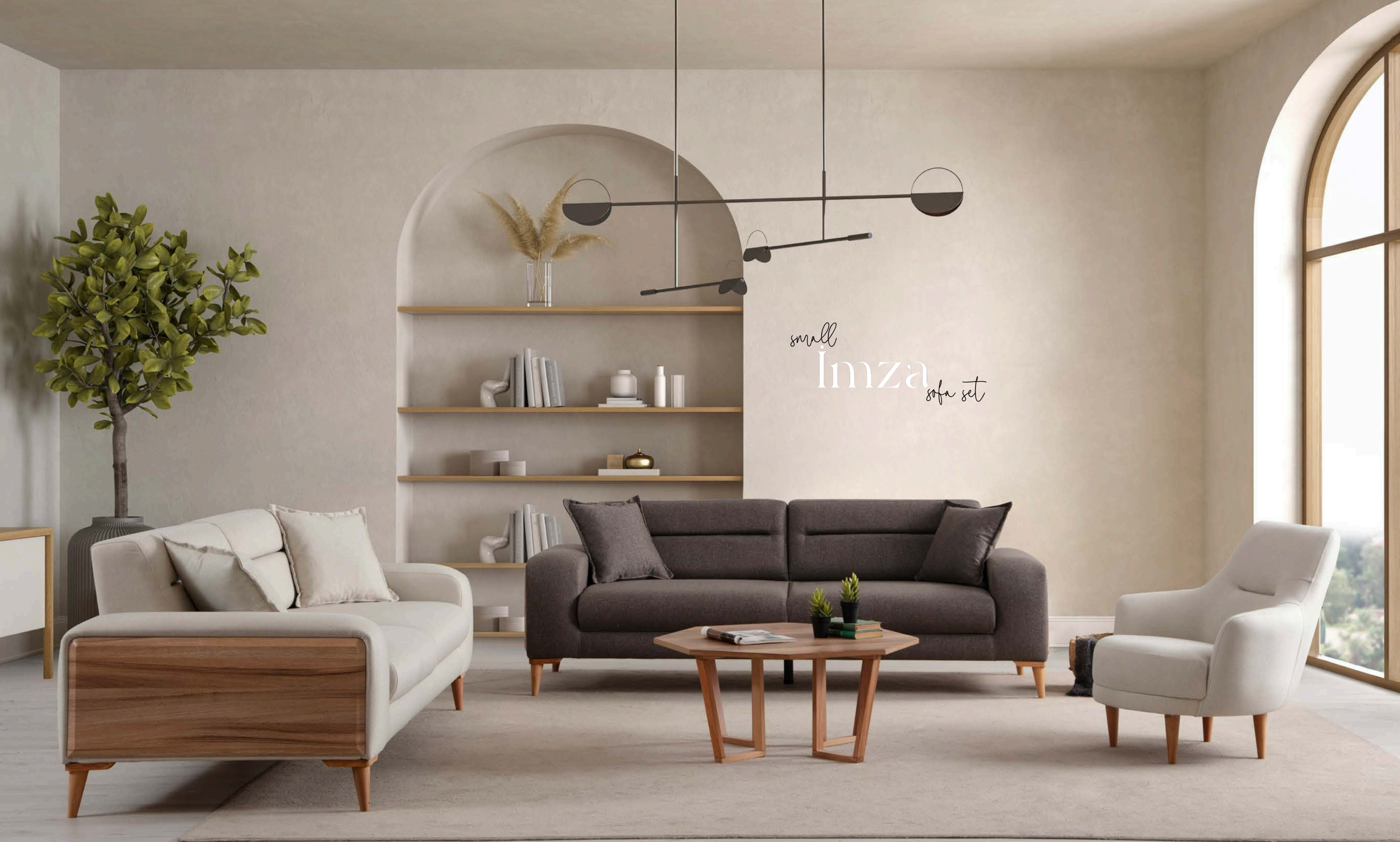
small İmza sofa set