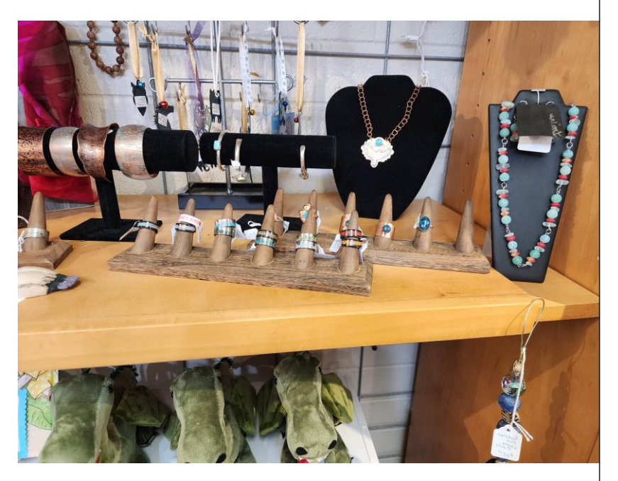
At the Endeavor Gallery we have the perfect gift for anyone on your list.