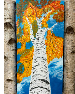
Art by Herb Jagow Featured Artist at Cochise College Benson Center